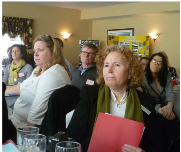
Audience members listen as legislators answer questions regarding education, healthcare, and funding.