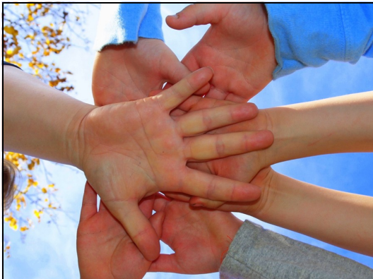
LAUREL PLAINS ELEMENTARY AWARD OF EXCELLENCE