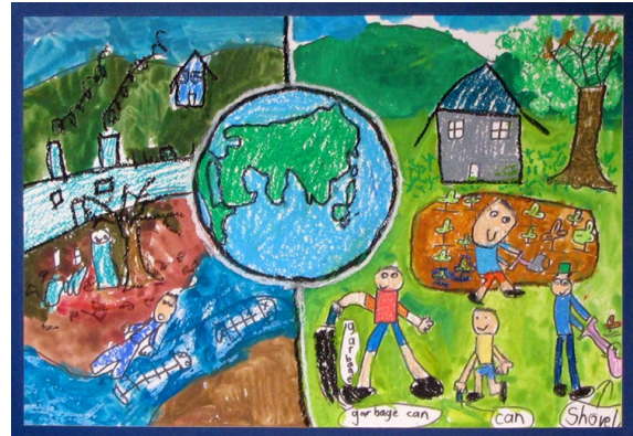
JESSIE BROWDE VISUAL ARTS STRAWTOWN ELEMENTARY AWARD OF EXCELLENCE